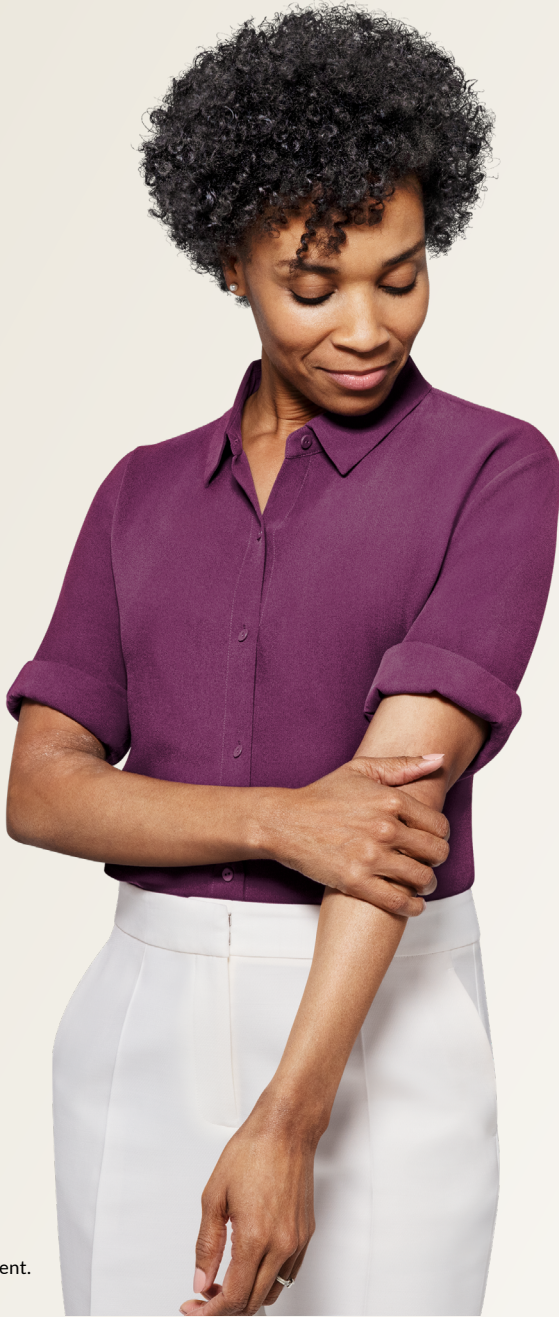
Not an actual patient.

To speak with a Nurse Navigator or enroll over the phone, call 1-855-NEMLUVIO, 8:00 AM - 8:00 PM ET, Monday - Friday.