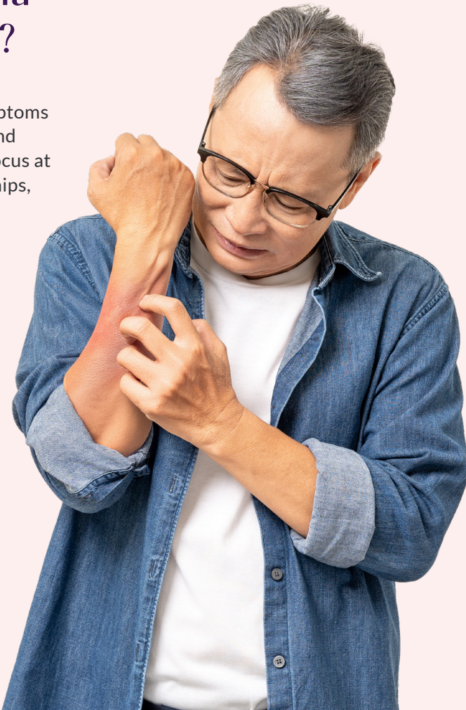
Not an actual patient.

Inability to sleep or focus due to intense itch 4