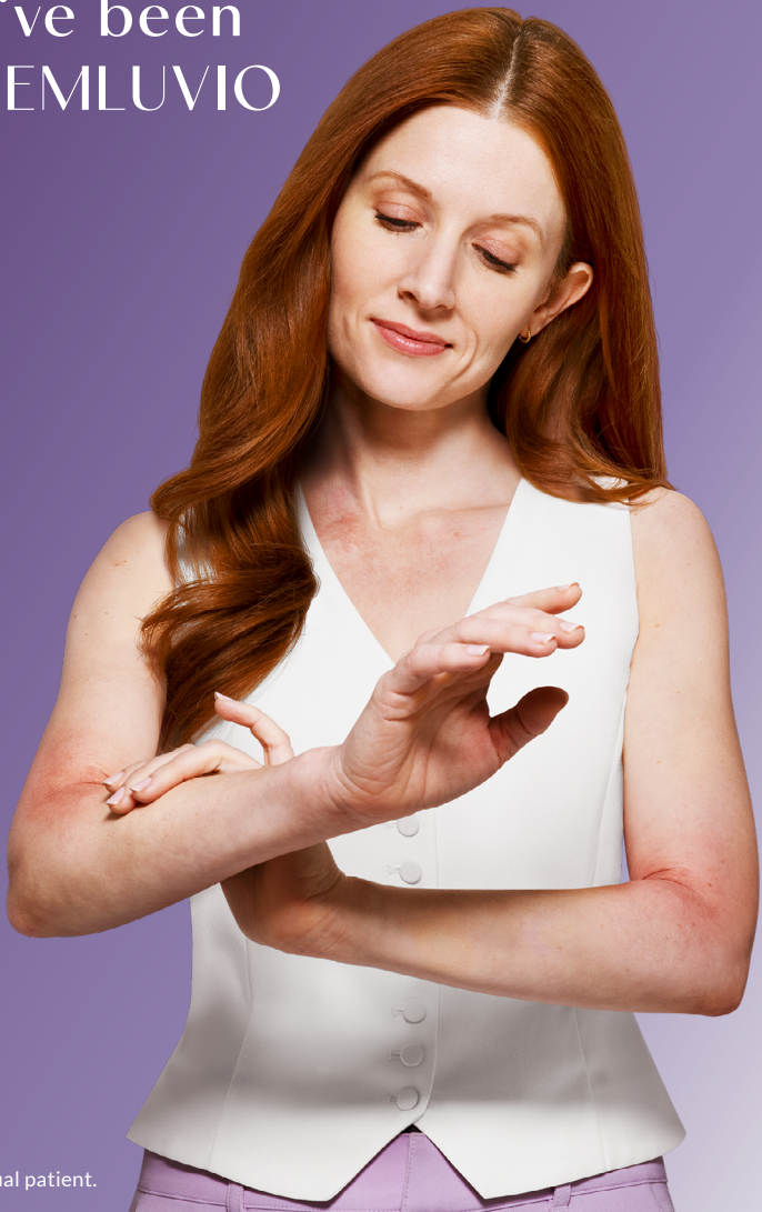
Not an actual patient.